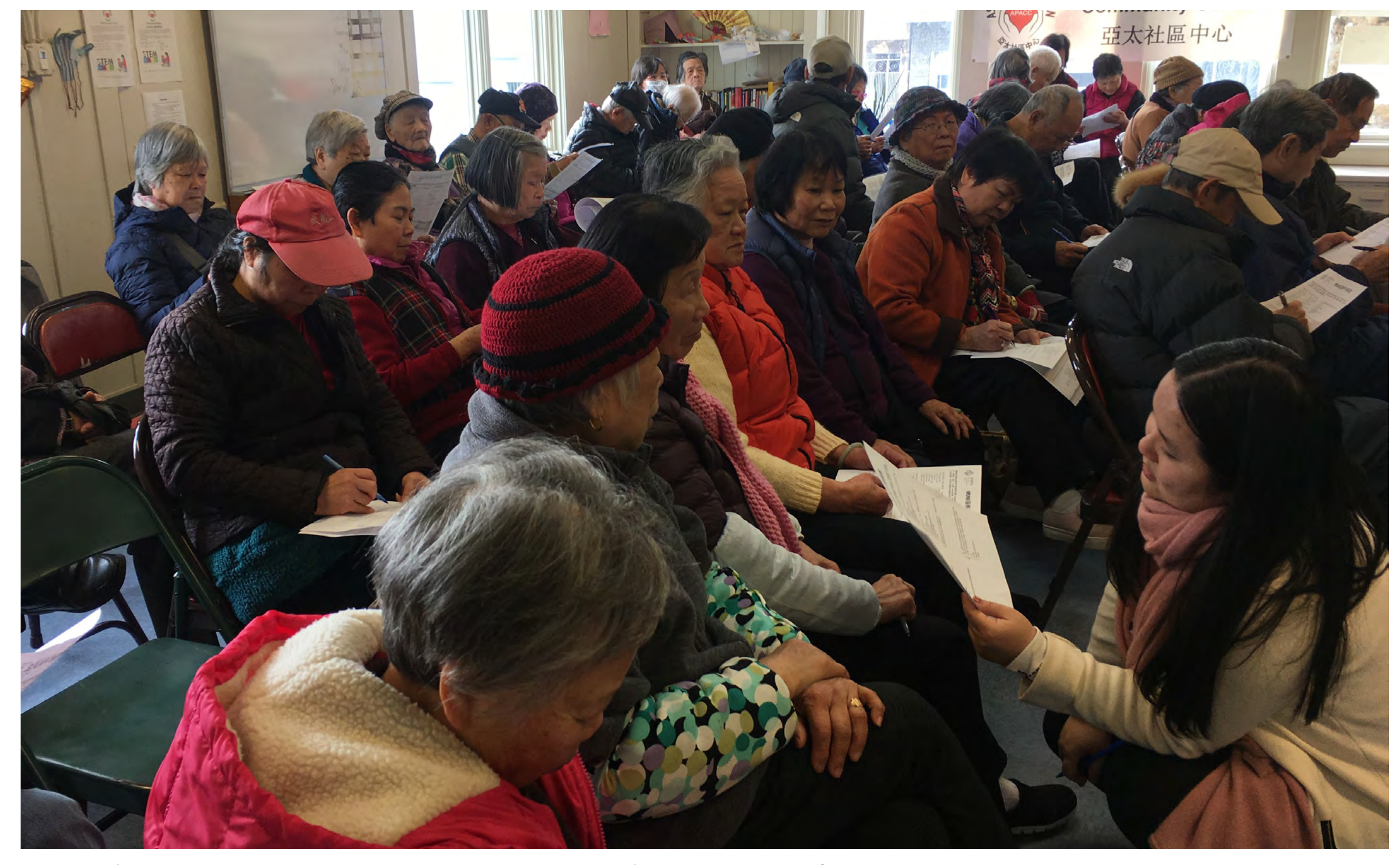
Image from a recent community conversation for the Equity Strategy.