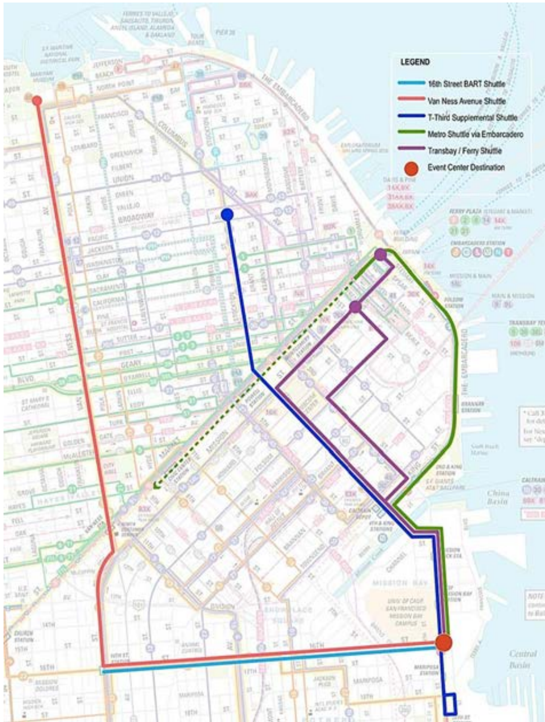
Figure 1 – Map of Supplemental Shuttle Routes