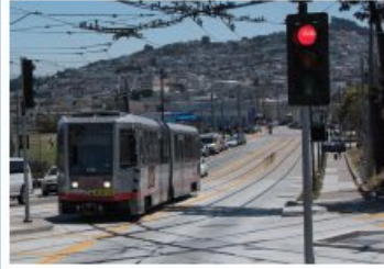
Trains stop frequently at red lights