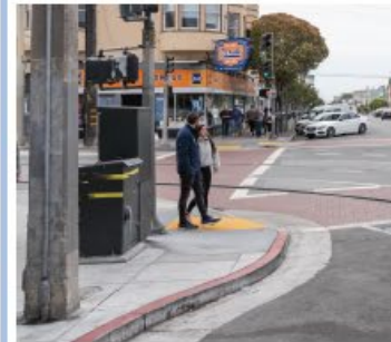
Install pedestrian bulbs (corner sidewalk extensions)