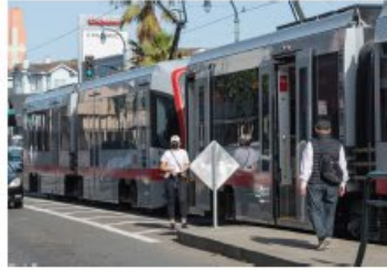
Low capacity and transit delays from single-car trains