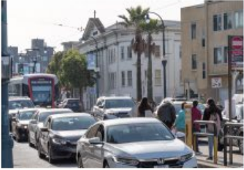
Traffic congestion delays transit