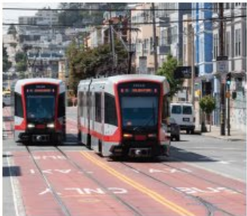
Install transit lanes