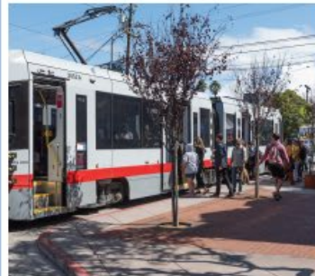
Remove some closely spaced stops