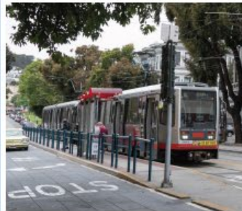
Extend and upgrade platforms