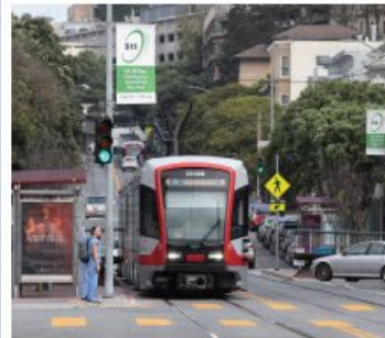
Retime and upgrade traffic signals