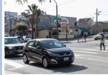
Safety concerns for people walking