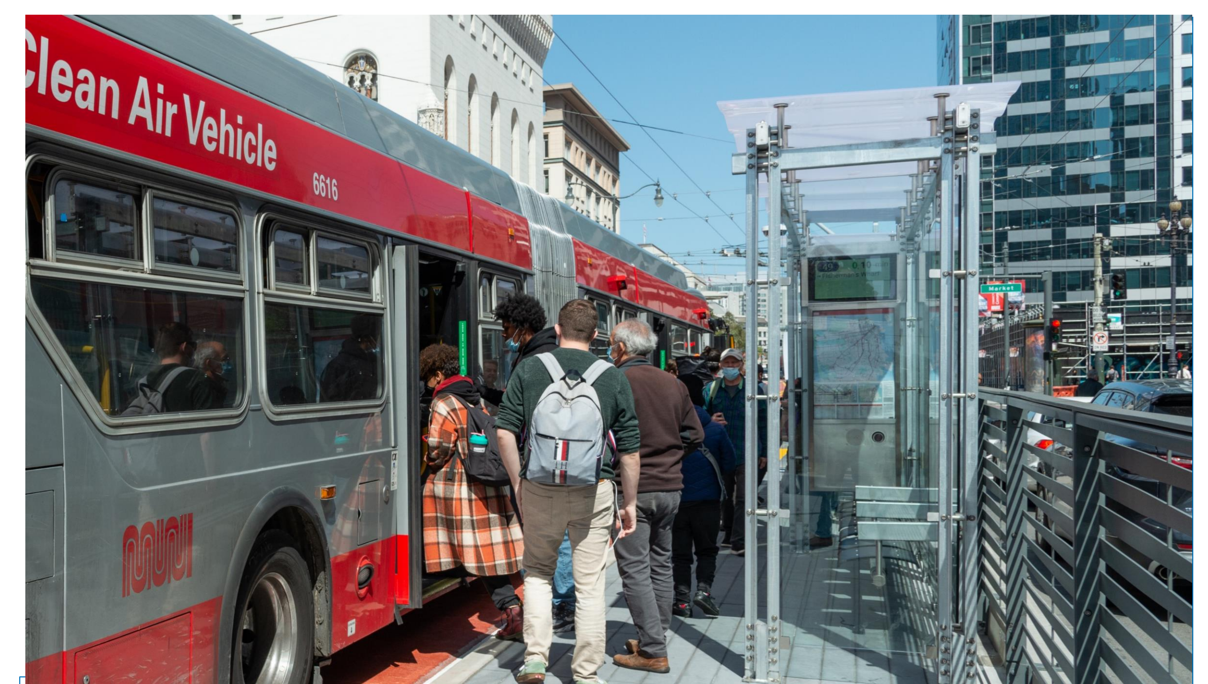
Transit Priority projects like Van Ness BRT increase connections to essential destinations