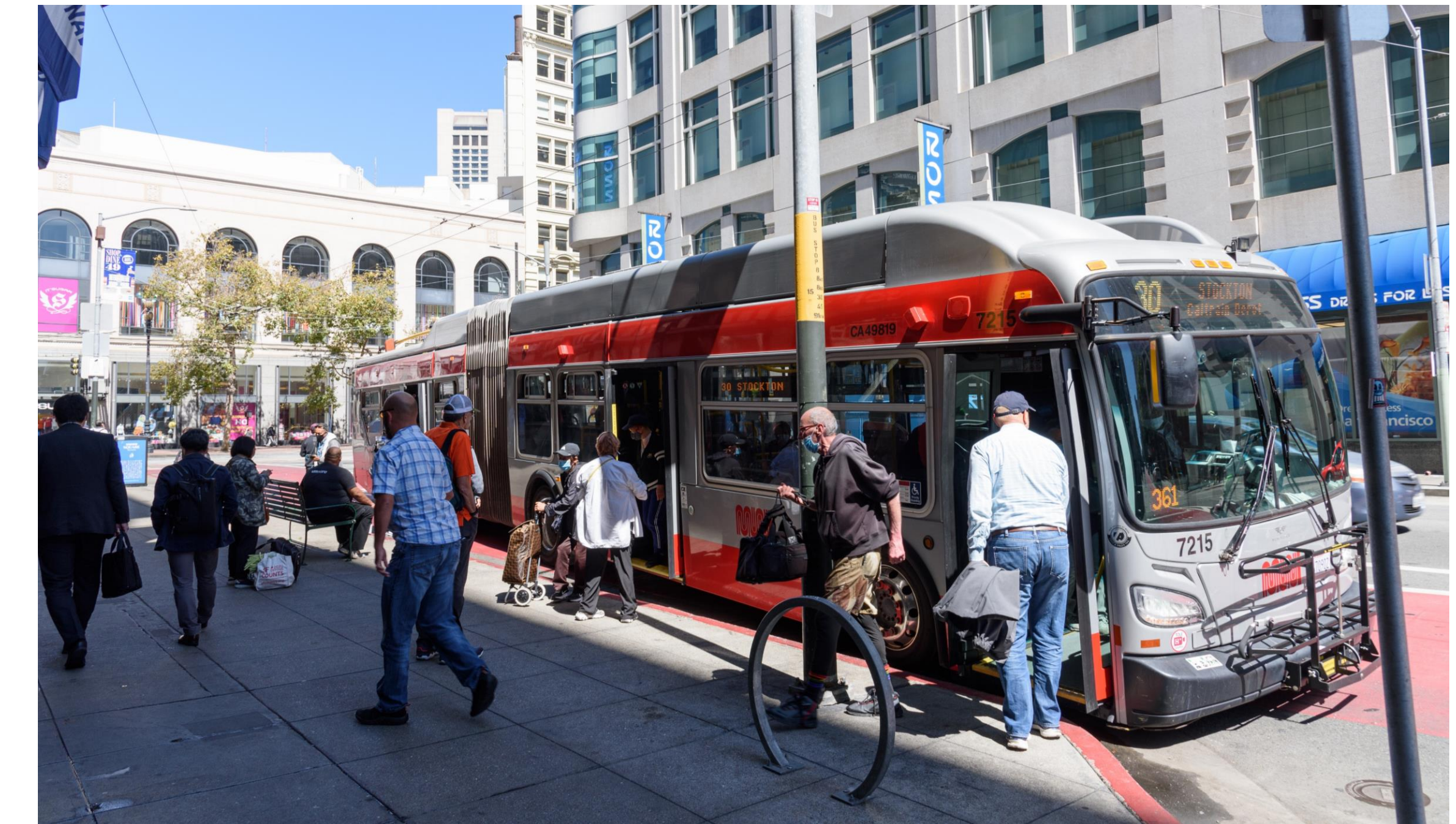
Routes like the 30 Stockton serve SFMTA Equity Neighborhoods

Using data and public feedback, provide service options by summer 2024 to inform any potential initiatives for additional operating funds