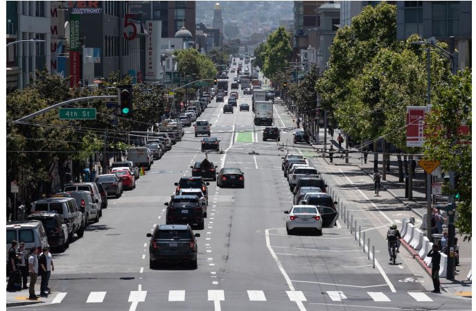
Howard Street at 4th Street, looking westward

Located in the South of Market neighborhood (SoMa), between 11th and 4th streets, the Howard Streetscape Project will improve safety on a high-injury corridor, reduce greenhouse gas emissions, support the City's transformative vision for SoMa as a regional hub, and improve mobility for visitors and residents, including low-income populations who depend most upon riding transit, walking and bicycling.