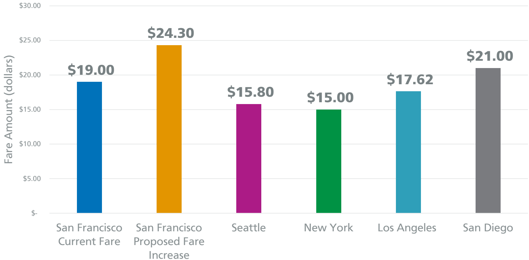
Metered Fare for Five Mile Trip