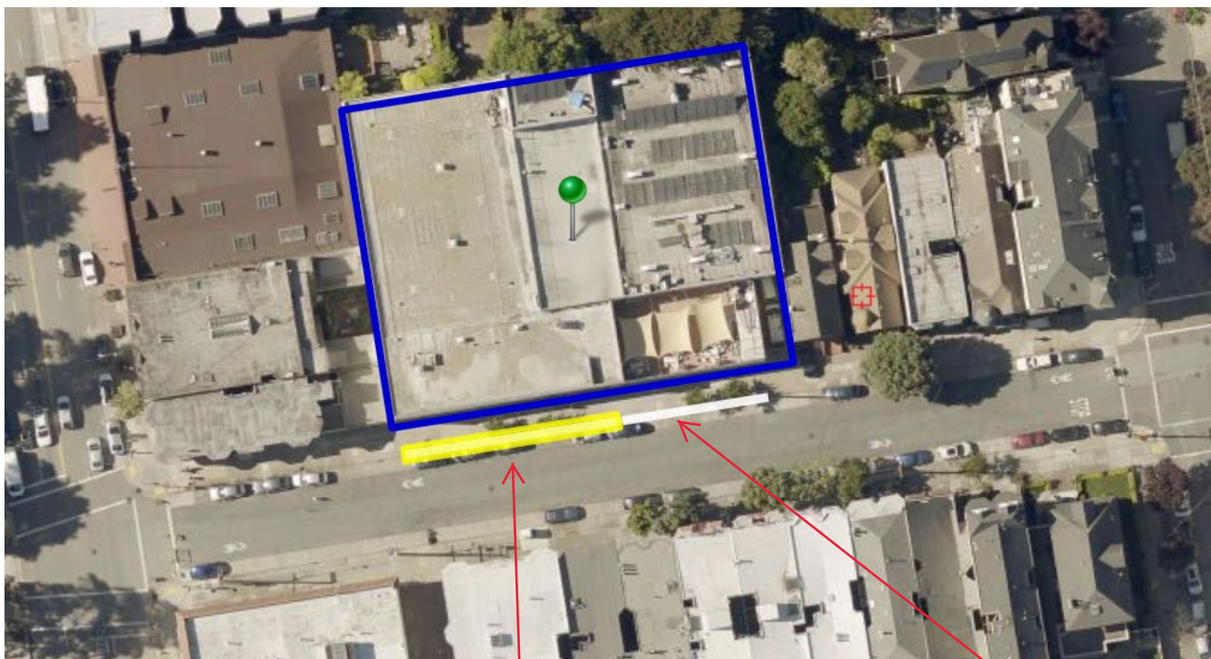
Aerial view of 1950 Page Street

Proposed white zone extension (equivalent to 6 spaces)