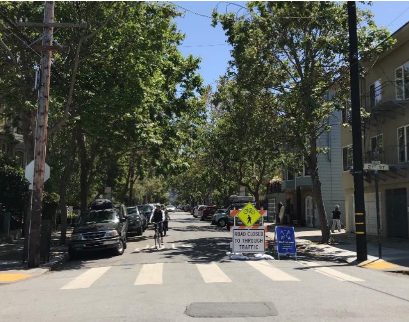
May 2020 – February 2021