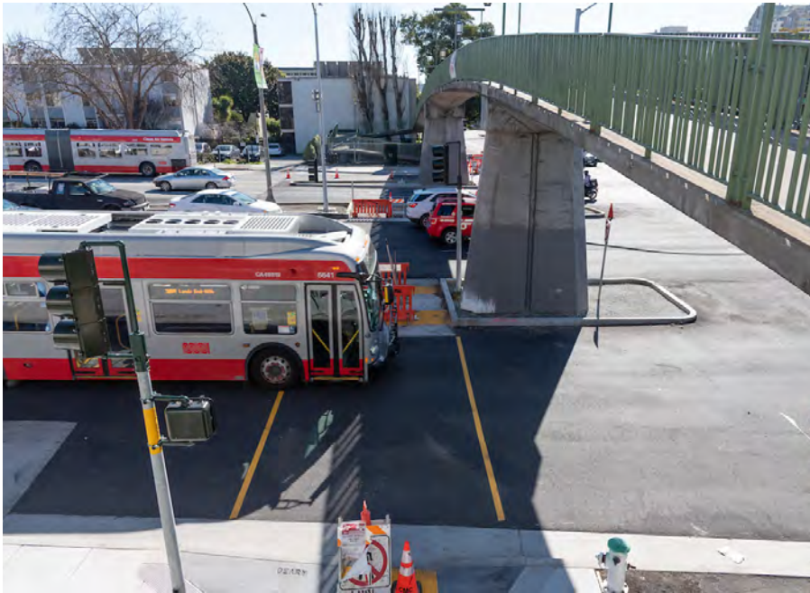
New crosswalk at Webster