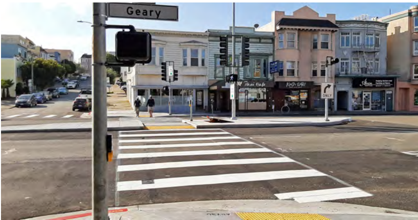
Traffic signals activated at Cook and Commonwealth/Beaumont