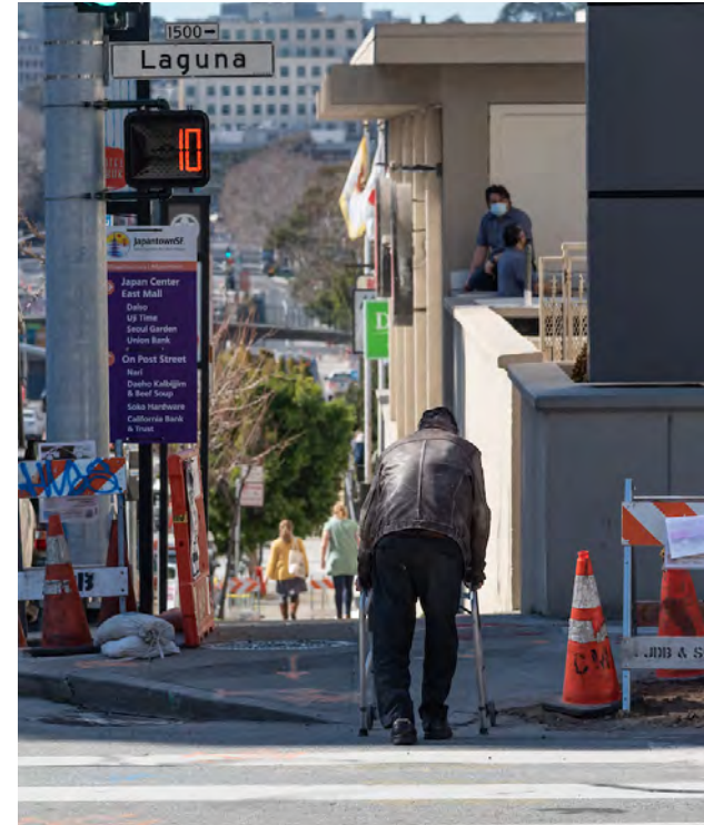
Pedestrian countdown signals at Laguna