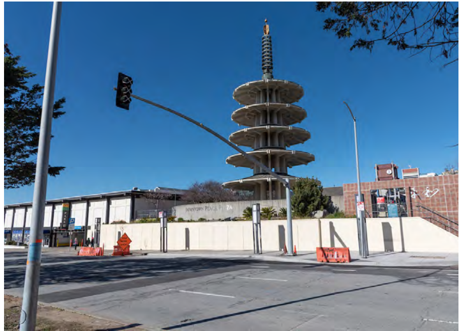
Proposed crosswalk at Buchanan