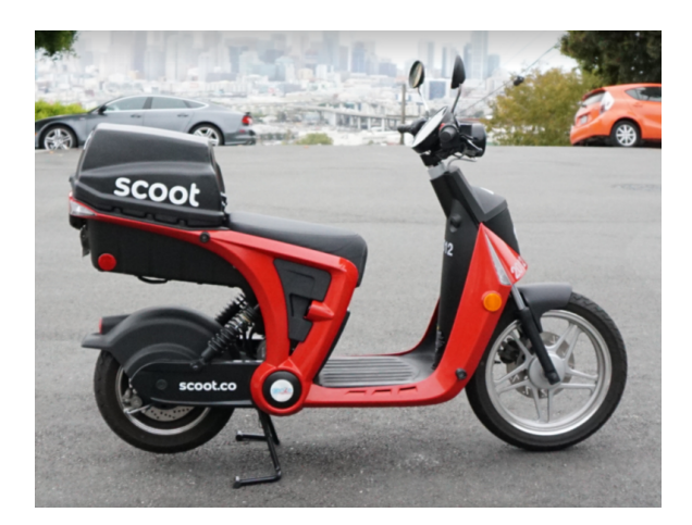
Scoot electric moped