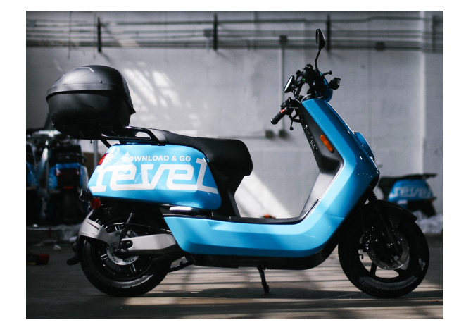
Revel electric moped

The permit applies to all RPP areas citywide, equivalent to a standard RPP permit.