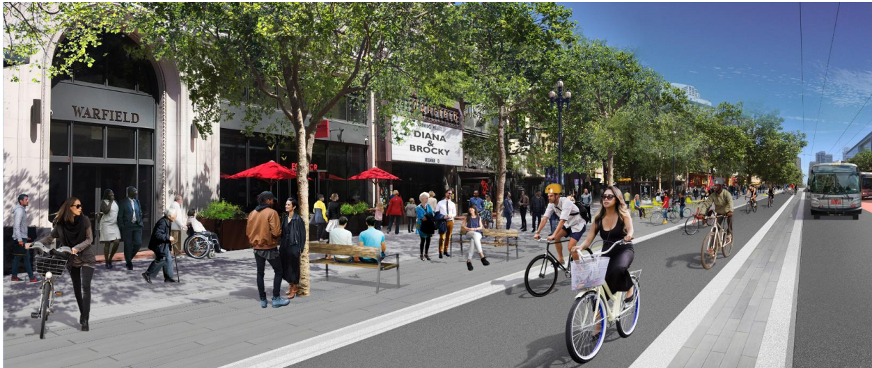
Figure 4. Proposed Project Visualization