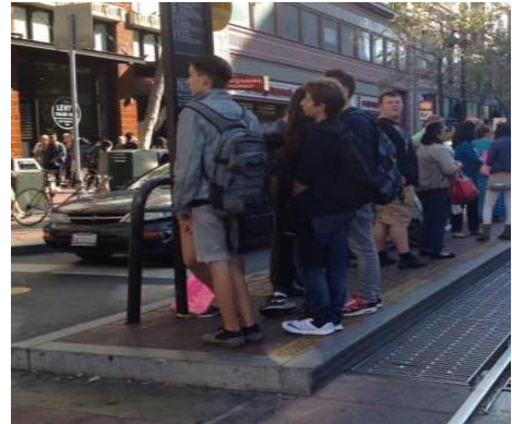
Figure 2. Existing narrow center-boarding islands are crowded and do not provide wheelchair access.