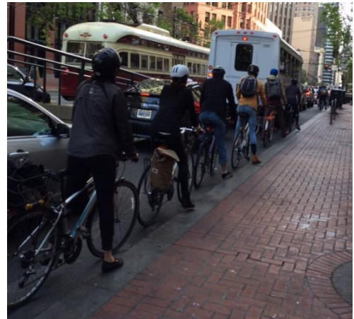
Figure 3. People biking on Market Street squeeze between cars queued and the sidewalk.