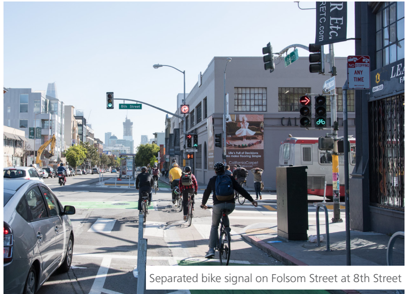
Separated bike signal on Folsom Street at 8th Street

On average, people biking complied 86% of the time at the two observed locations with separated signals.