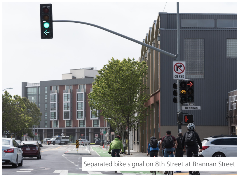
Separated bike signal on 8th Street at Brannan Street

During non-compliant instances, bikes and pedestrians were not present.