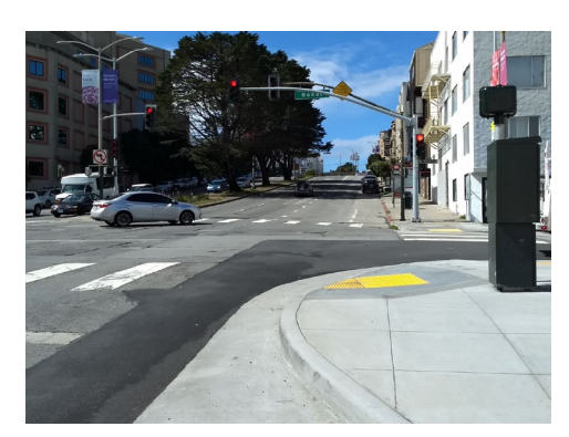
Pedestrian bulbs help make people walking more visible to cars and shorten crossing distances.

Utility work started at Masonic Avenue and is moving east along Geary towards Van Ness Avenue. Sewer, water and fiber optic conduit installation is expected to take about 2-3 months per block. After new water mains have been installed, water service to some properties may be briefly shut off while SFPUC connects to the new water main. SFPUC will coordinate with businesses and send out water shut-off notices in advance.