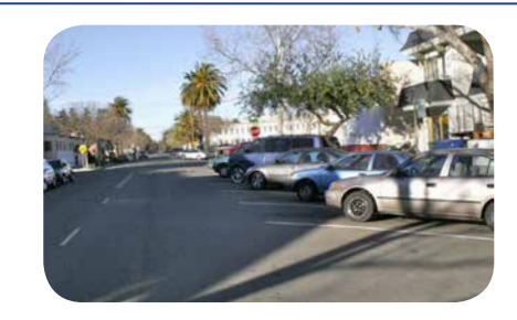
Back-in angled parking narrows the roadway, calming traffic while providing additional parking spaces.

Together, the near-term measures would result in a reduction of 14 parking spaces over the 2-mile, 18-intersection corridor.