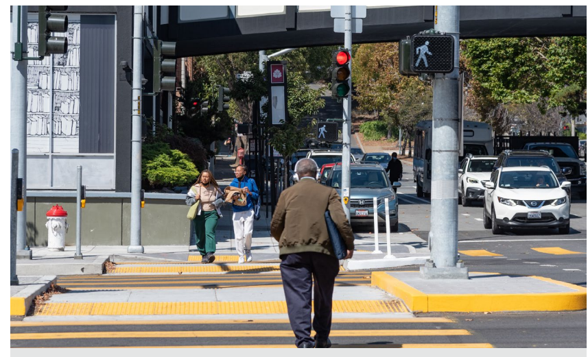
Traffic and Pedestrian Signal Upgrades in Tenderloin and Western Addition