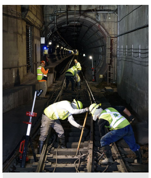
Muni Tunnel SGR