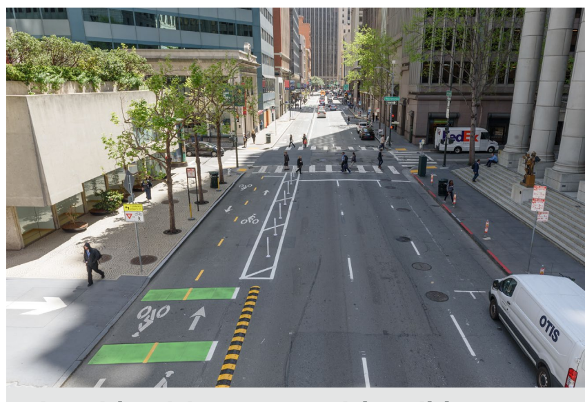
Citywide Vision Zero Quick-Build Program