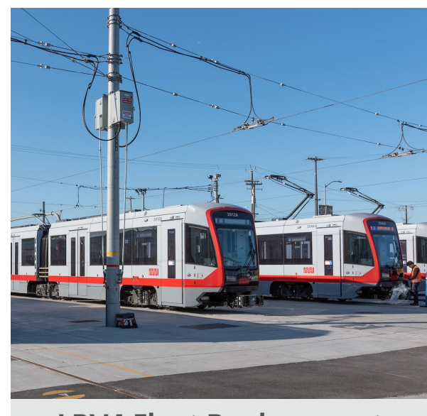
LRV4 Fleet Replacement