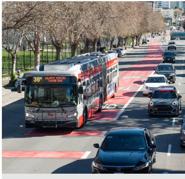
Geary Blvd Imp. Project