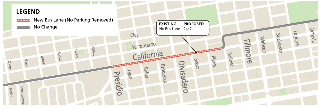
Figure 2: 1 California Proposal (western segment) (no revisions since Community Meeting)

In response to the feedback received, the project team has developed a revised proposal, shown in Figures 2 and 3 below. This proposal will be considered for approval at a future SFMTA Board meeting, tentatively anticipated on April 20, 2021.