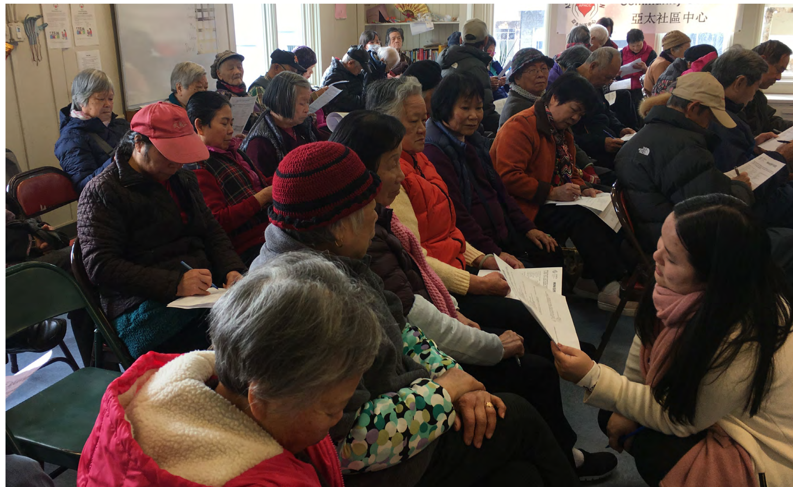
Image from a recent community conversation for the Equity Strategy.